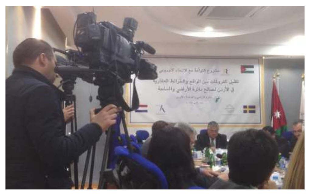
Figure 1.10: The mission in the EU Twinning project in Jordan was to enhance the technical and administrative capacities of the Department of Lands and Survey with the main purpose to reduce the discrepancies between the physical reality and the graphical cadastral information.

Countries which geodetic personnel have visited for assignments over the last four years are Albania, Belarus, Bosnia and Herzegovina, Georgia, Ghana, Jordan (see Figure 1.10), Kosovo, Republic of Macedonia, Rwanda and Serbia.