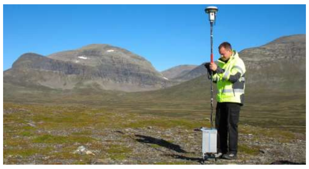
Figure 1.6: More than 3,400 new relative gravity measurements have been performed in Sweden since 2010. The heights of the locations are determined by network RTK measurements. Photo: Örjan Josefsson.

The work with NKG2015 was performed in the geoid model project of the NKG Working Group of Geoid and Height Systems. An update of the NKG gravity database for the whole Nordic-Baltic area and a creation of a new NKG GNSS/levelling database and a common DEM¹8 were also included in the project. Independent computations for NKG2015 were first made by five computation centres – from Sweden, Denmark, Finland, Norway and Estonia – using different regional geoid computation methods, software and set-ups. The modelling method utilised for the final model, the Least Squares Modification of Stokes' formula with additive corrections, was chosen based mainly on the agreement to GNSS/levelling. GNSS/levelling evaluations show that NKG2015 is a significant step forward, not only compared to previous NKG geoid models, but also with respect to other state-of-the-art ones covering the whole Nordic-Baltic area, e.g. EGM2008, EGG2015 and EIGEN-6C4.