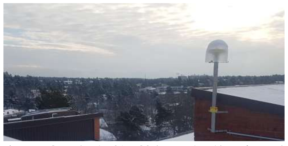
Figure 1.4: Gustavsberg is a SWEPOS class B station with a roof-mounted GNSS antenna mainly established for network RTK purposes.

By the time for the 18th NKG General Assembly in September 2018 SWEPOS consisted of totally 401 stations (41 class A stations and 360 class B ones), see Figures 1.3 and 1.4.