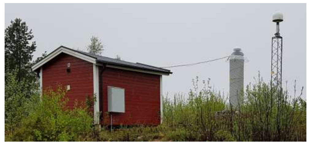
Figure 1.3: Sveg is a SWEPOS class A station. It has both a new monument (established in 2011) and an old monument (from 1993).

SWEPOS uses a classification system of permanent reference stations developed within the NKG (Engfeldt et al., 2006). The SWEPOS stations belong either to class A or class B, where class A meets the highest demands.