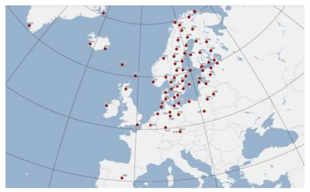
Figure 1.1: The NKG EPN AC sub-network of 88 permanent reference stations for GNSS.

Lantmäteriet operates the NKG AC<sup>6</sup> for EPN<sup>7</sup> in cooperation with Onsala Space Observatory. The NKG AC contributes with weekly and daily solutions using the Bernese GNSS Software version 5.2. The EPN sub-network processed by the NKG AC consists of 90 reference stations concentrated to northern Europe, see Figure 1.1. This means that 31 stations have been added to and 2 stations have been redrawn from the NKG AC sub-network since the previous NKG General Assembly four years ago. NKG has through Lantmäteriet been represented at the ninth and tenth EUREF<sup>8</sup> AC Workshops held in 2015 and 2017.