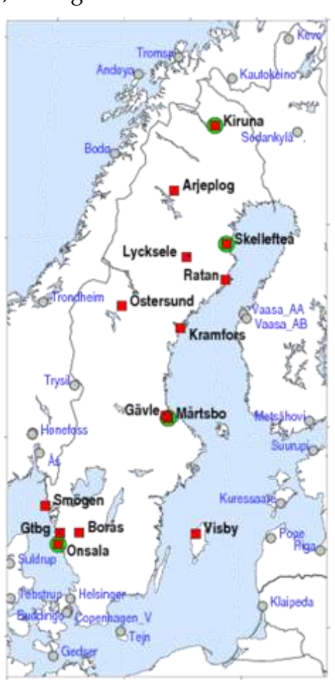
Figure 1.7: There are 14 absolute gravity sites (for FG5/FG5X) in Sweden marked with red squares in the map. Absolute gravity sites in neighbouring countries are marked with grey circles. The four sites with time series more than 15 years long have a green circle as background to the red square.

Absolute gravity observations are also performed abroad, mainly in the Nordic countries. They have however during the last four-year-period been limited to gravimeter intercomparisons (one in Belval and one in Wettzell), which now means that totally eight such comparisons have been carried out.